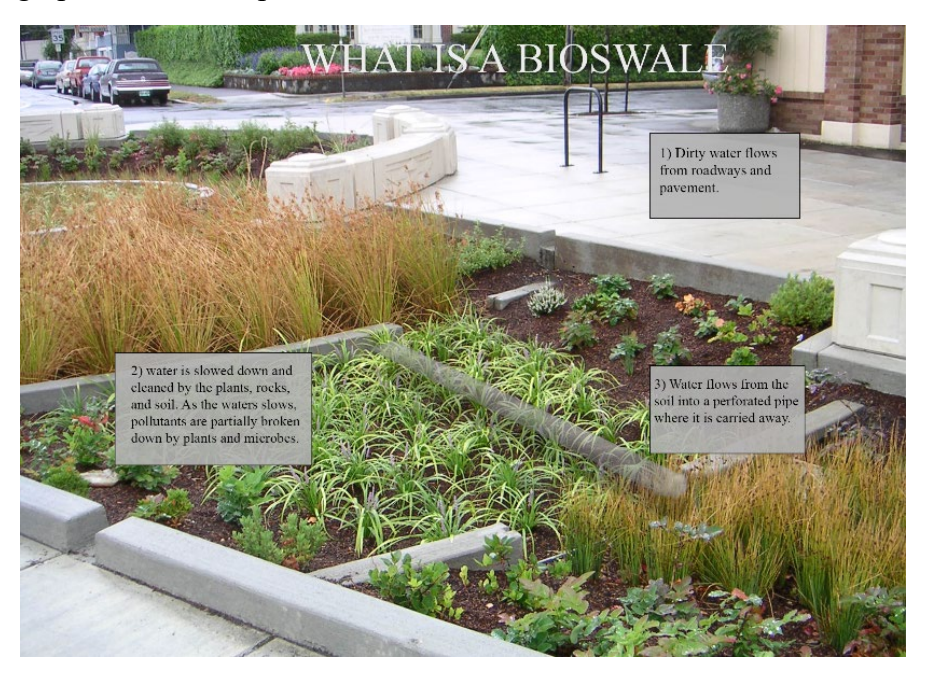
Figure 2: Infographic and Description of Bioswale