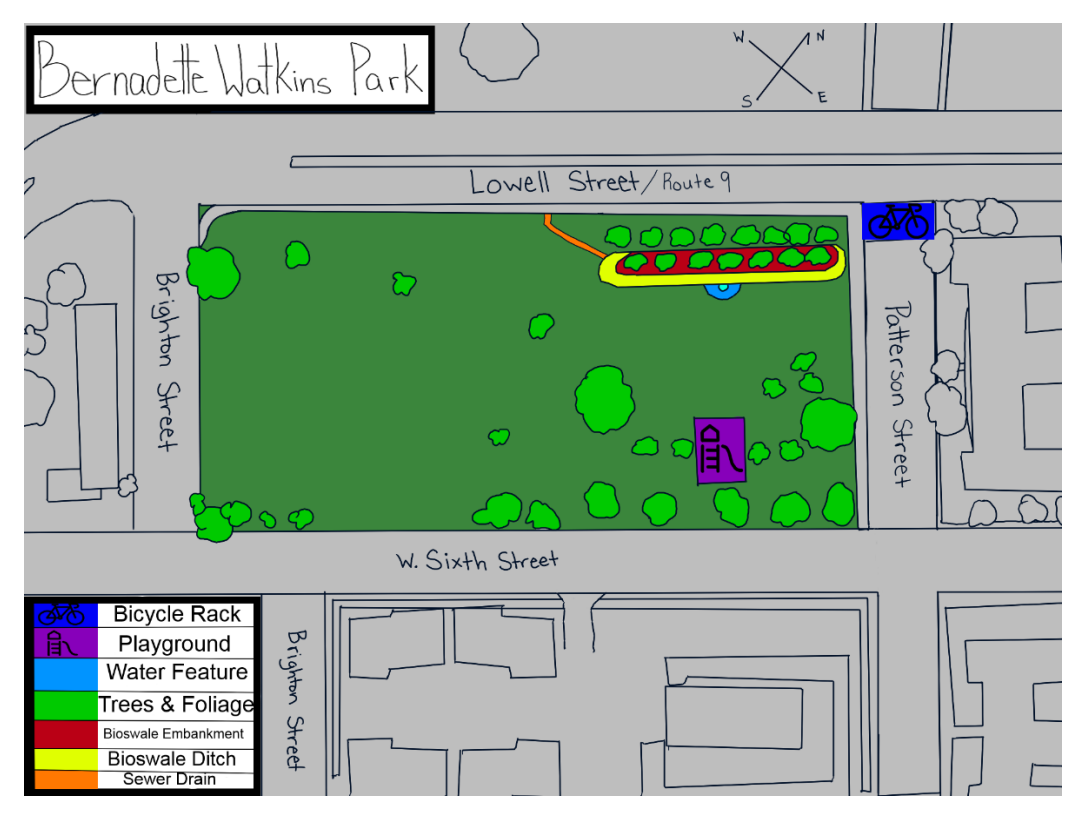
<u>Figure 1</u>: Drawing and Description of Proposed Changes to Bernadette Watkins Park Used in the Survey

"Based on community feedback the Strategic Depaving Project has developed a layout for a potential addition to the current Bernadette Watkins Park in the city of Newport, Kentucky, represented in the map above. The park is located on 6th and Patterson Street and currently consists of a small playground along 6th Street joined by a small collection of trees."