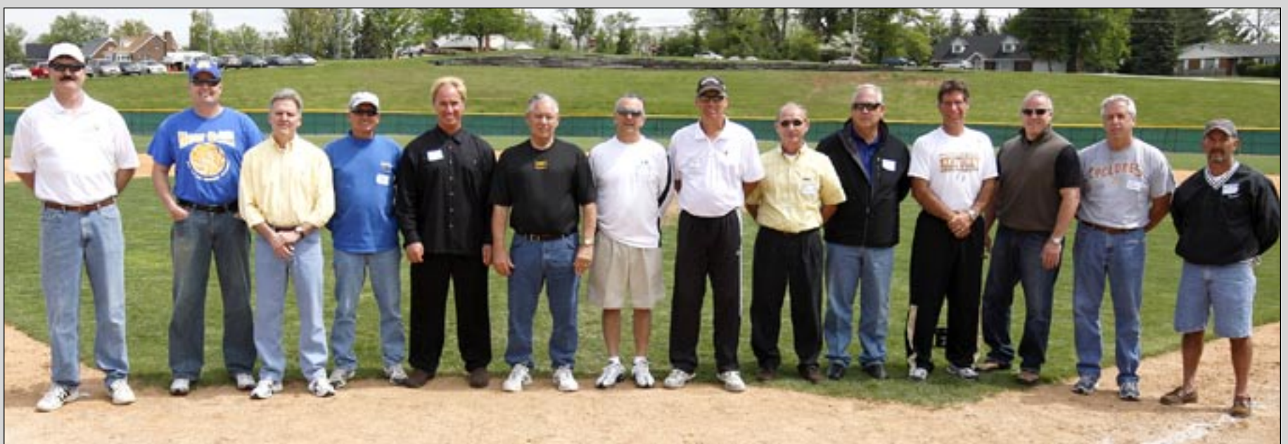
Members of NKU's 1979 NCAA Division II World Series are recognized Saturday afternoon during the Norse's doubleheader against Missouri S&T. That NKU squad posted a 36-15 overall record and captured the NCAA Division II Great Lakes Regional championship.