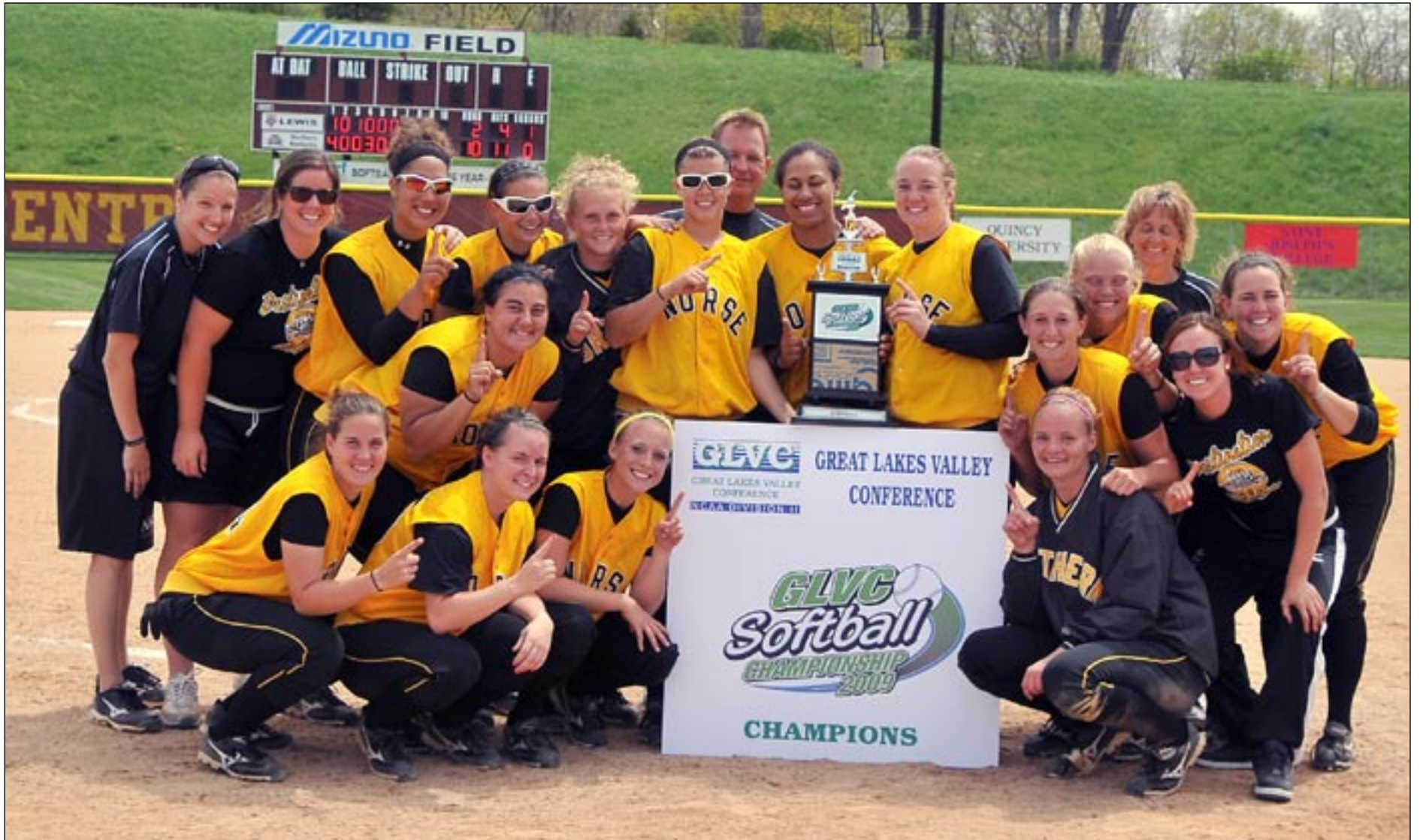
Members of the NKU softball team celebrate after capturing the GLVC Tournament championship with a 10-2 win against Lewis on Sunday. The Norse won the GLVC Tournament for the first time since 2005 and earned the league's automatic bid to the NCAA Tournament.