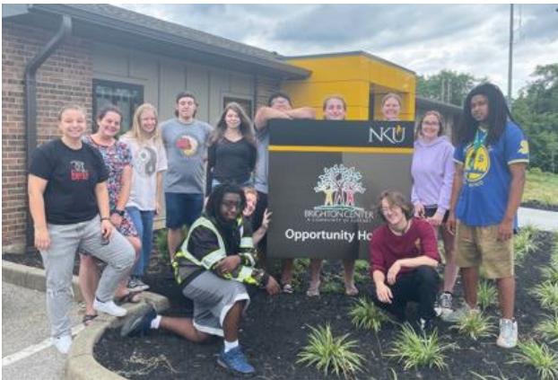
First Residents at Opportunity House