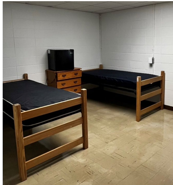
Callahan Hall student room, August 2022