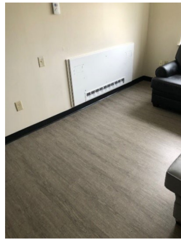
Norse Hall Interior – room finishes