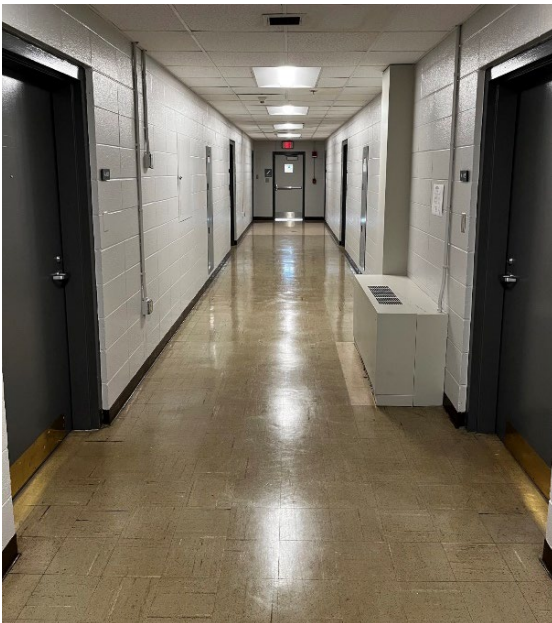
Callahan Hall corridor, August 2022