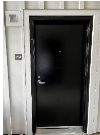
Norse Hall Exterior – painted windows frames and facade, new doors and signage