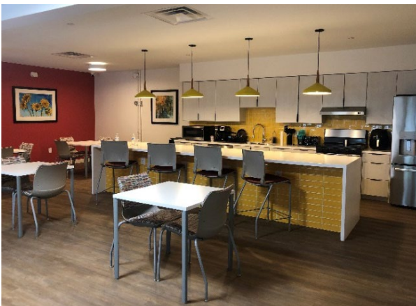
Shared Kitchen and Dining