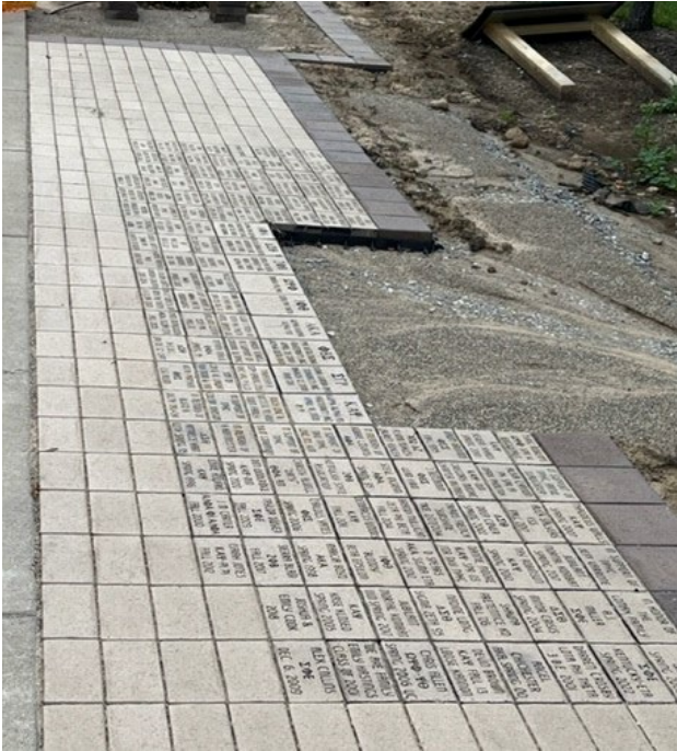
Newly installed pavers