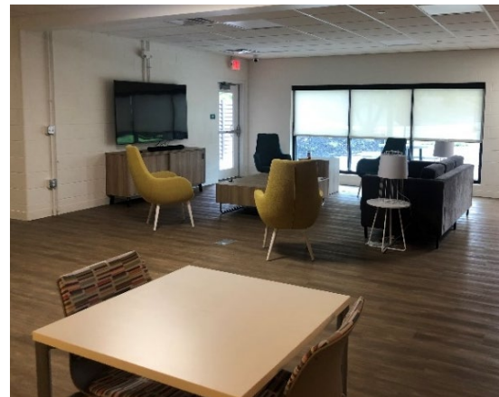
Shared Living Room