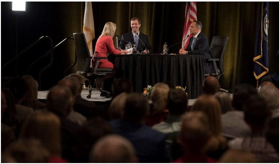
NKU hosts a gubernatorial debate in the Student Union Ballroom on October 29, 2019, between Andy Beshear and Matt Bevin.