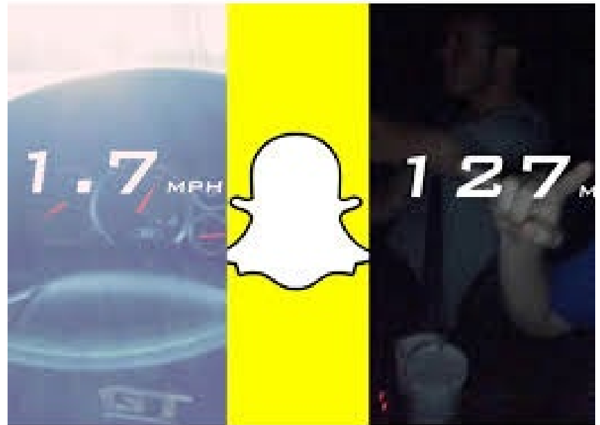
Snapchat Speed Filter