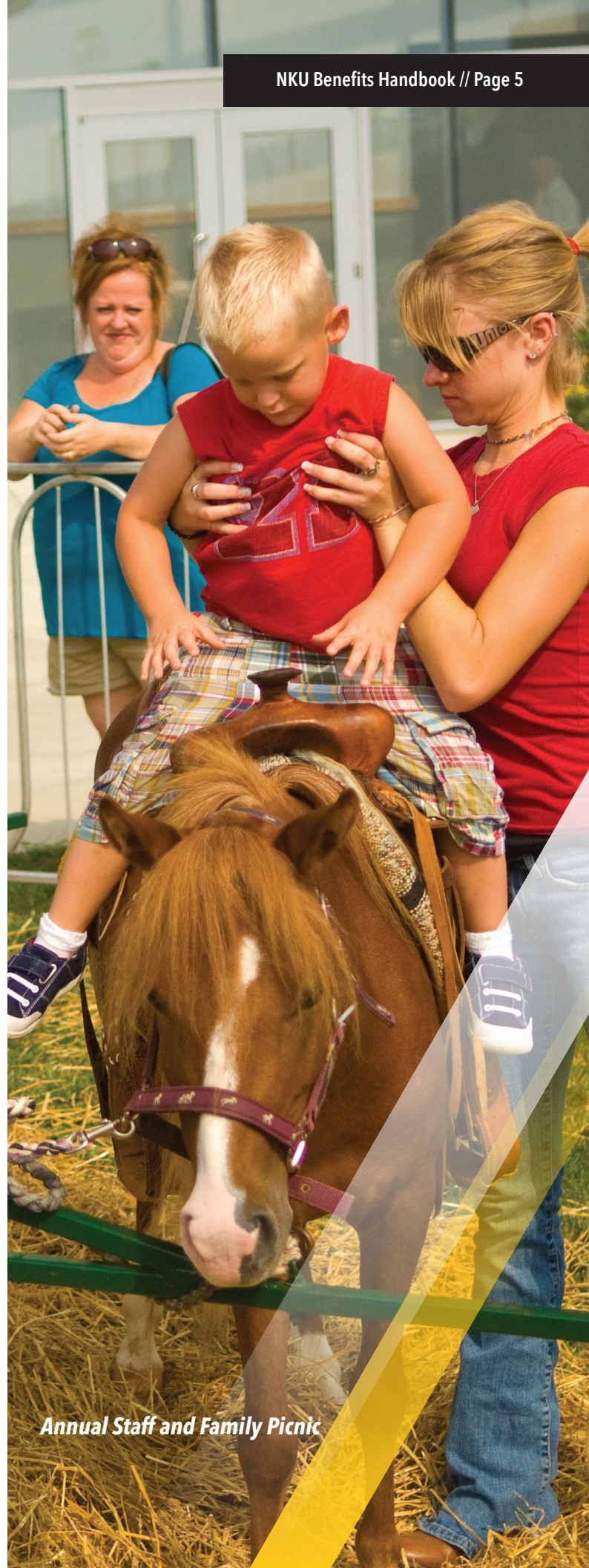
Annual Staff and Family Picnic

For more information, see our Tuition Waiver web page.