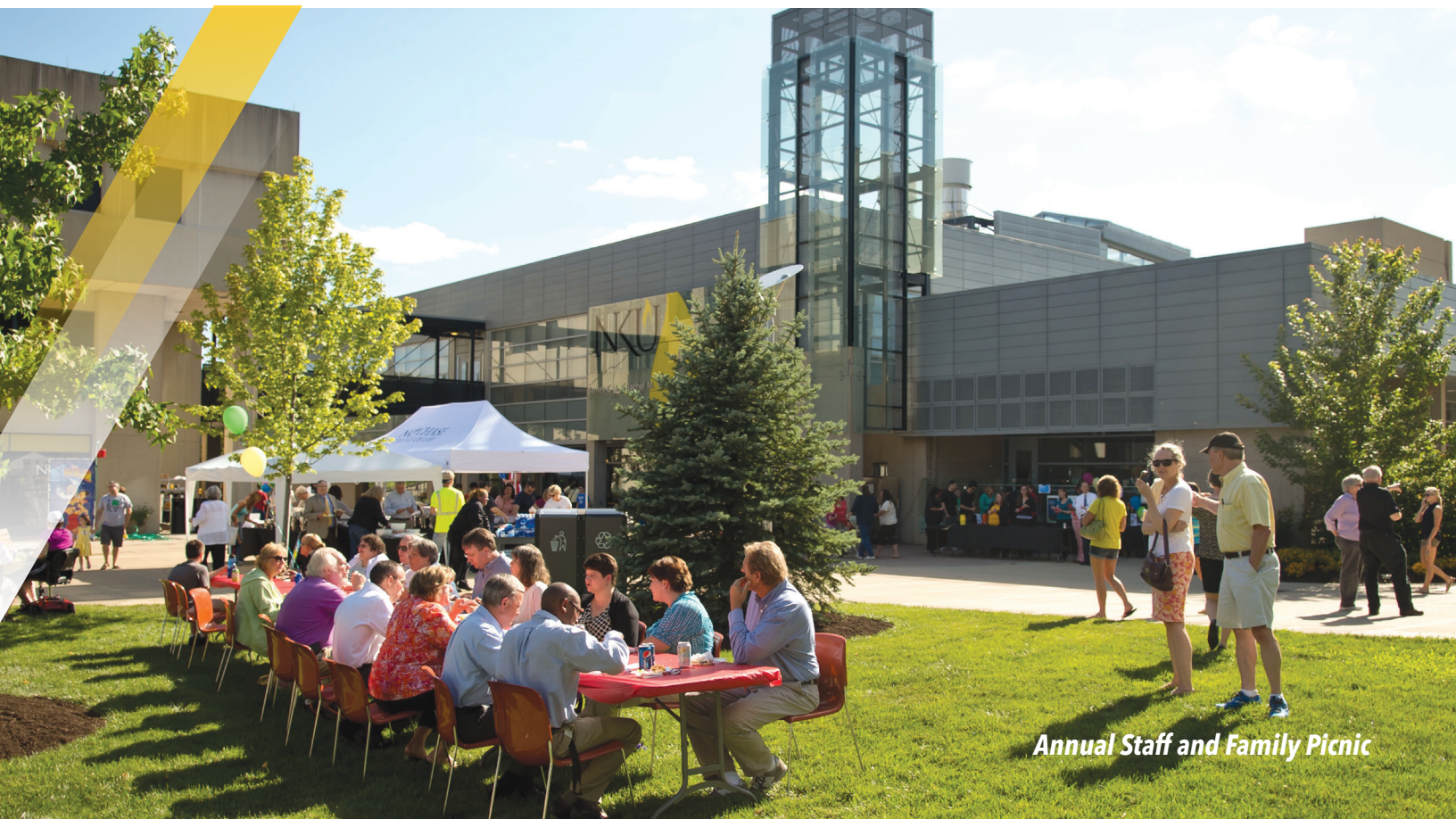
Annual Staff and Family Picnic

Sick leave may be accumulated without limitation. Full-time staff members accrue one day of sick leave for each calendar month of employment. Part-time staff accrue sick hours based on actual hours worked.