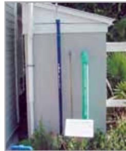
These cisterns at the Florida House Learning Center each hold 2,500 gallons of rainwater.