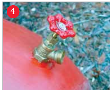
The rain barrel outlet is now complete.