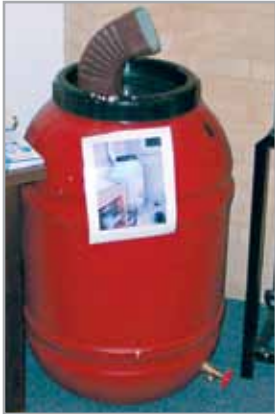
Hillsborough County Extension Service has a demonstration rain barrel.

Many county Extension offices have rain barrel demonstration exhibits where you can see examples of rain barrels that any homeowner can install. The Extension offices also provide an abundance of information on plants, gardening, composting and water conservation. Most county Extension offices offer workshops on all of these subjects.