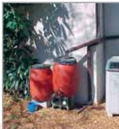
Gutters and downspouts funnel rainwater to the rain barrels.

Most storage tanks are placed above ground to take advantage of the force of gravity. A below-ground tank requires a pump to get the water out. This increases the cost and maintenance of the system.