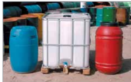
Some common containers used for rain barrels are (left to right): 50-gallon sealed barrel, 275-gallon juice container, 50-gallon open-top barrel.