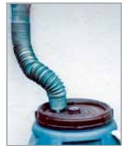
Flexible downspout extender