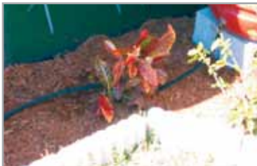
Attach a soaker hose to water nearby plants.