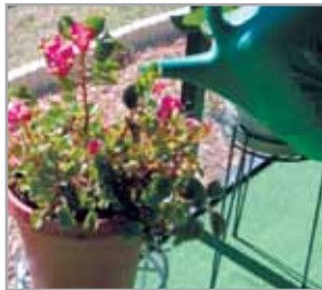
Hand water plants.

soaker hose or a length of PVC pipe or garden hose with holes punched in it may work with these low pressures. If using a soaker hose, take out the pressure-reducing washer to allow more water to flow through the hose ( bottom right ). Filling a watering can to water plants around the yard is always an option. You can also use the water to keep your compost bin moist or to rinse off gardening tools.