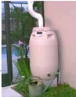
This barrel was painted to match the house color.

Outdoor acrylics and spray paint work well, but the barrel must first be primed so these materials adhere properly to the surface. A product on the market is a spray paint designed specifically for outdoor plastic furniture, but it will work on almost any plastic surface. The benefit to this product is that the barrel does not have to be primed before applying the spray paint. If using spray paint but need to paint small details, spray some paint into a small cup, making a liquid puddle. This paint can be brushed on.