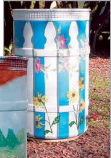
Rain barrels may be painted to increase their aesthetic value.