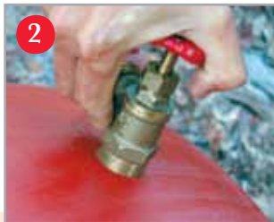
Next, screw in the hose spigot about halfway. Make sure the threading is going in straight, as this will help prevent leaking.