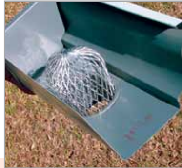
A window screen placed over the barrel opening (left) or a gutter strainer placed in the downspout opening (right) will keep leaves and other debris out of the rain barrel.