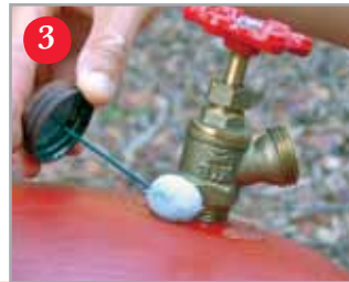
When the spigot is in about halfway, apply a liberal amount of PVC cement to the exposed threads. Continue to screw in the spigot until it is snug and pointing toward the bottom of the barrel.