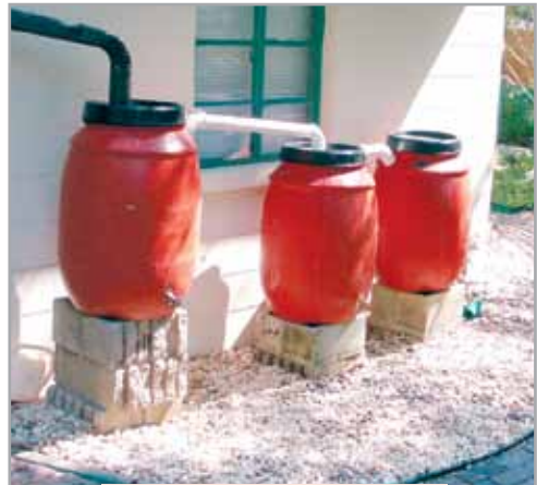
Multiple barrels provide for greater water storage.

Cisterns and rain barrels have been around for thousands of years and the time has come for more homeowners to enjoy their benefits.