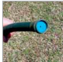
Remove the pressure-reducing washer from the soaker hose.